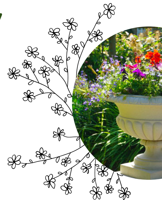
COUNTRY CLUB DISTRICT HOMES ASSN