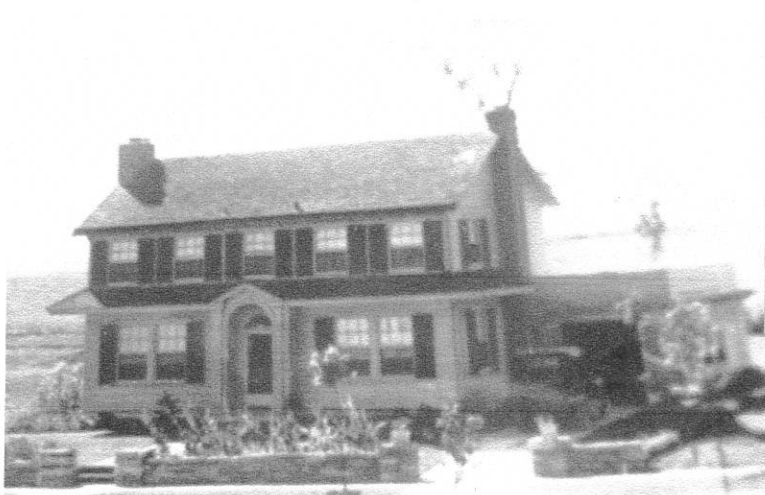
The Verkler Home—1001 West 61st Street; Pictured in the mid 1950's