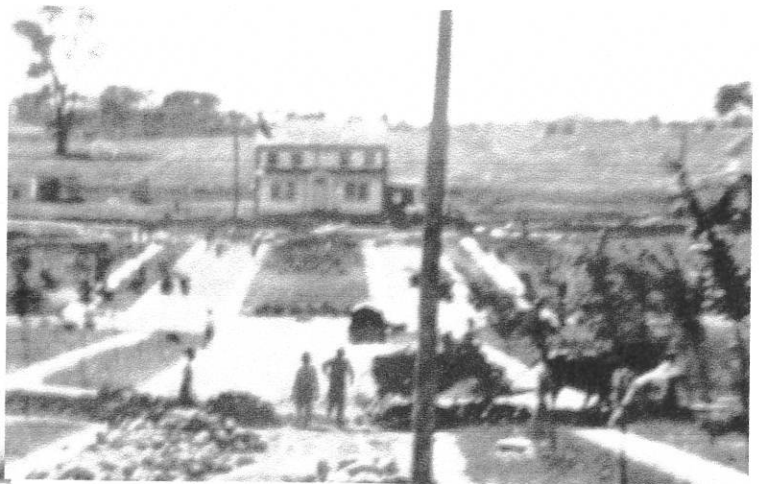
Construction of Schmelzer Island; North of Verkler Home