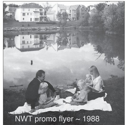
NWT promo flyer ~ 1988