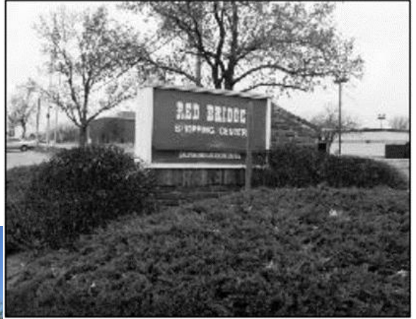
Red Bridge Shopping Center's development was first announced in 1958.

The 2016, $19 million renovation of Red Bridge Shopping Center has secured many new retail tenants, and there will be more to come! Here are just a handful: Blue Bicycle Fitness, Wonderscope Children's Museum, SERC physical and hand therapy, Blue Moose Bar & Grill, Silks and Poles Aerial Fitness, and Eustons Hardware.