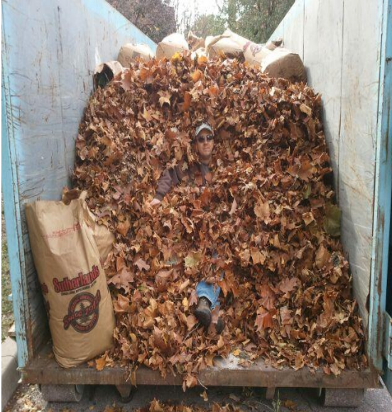
Photo Fun at the Fall 2012 Lawn & Leaf Clean-Up