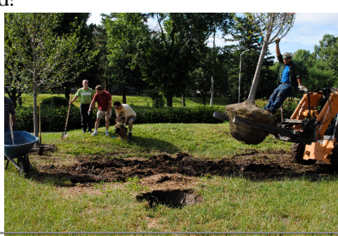
Please stay connected to your neighborhood: <a href="http://www.wornallhomestead.org/">http://www.wornallhomestead.org/</a>